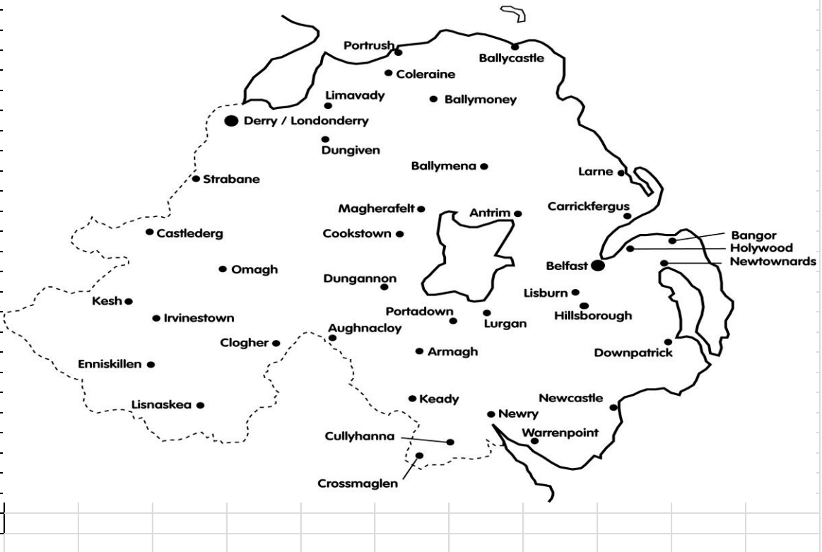
Outline Map of Northern Ireland: Main Cities, Towns and Villages